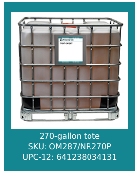
270-gallon tote SKU: OM287/NR270P UPC-12: 641238034131