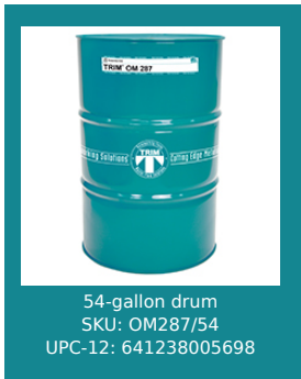
54-gallon drum SKU: OM287/54 UPC-12: 641238005698