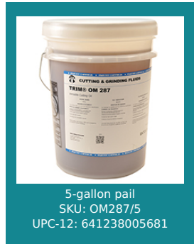
5-gallon pail SKU: OM287/5 UPC-12: 641238005681